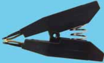
Insulated Kelvin Clip, 10 Amp