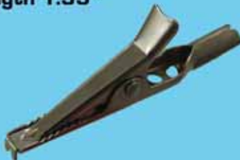
Alligator Clip, Steel, Fang Tooth with Barrel