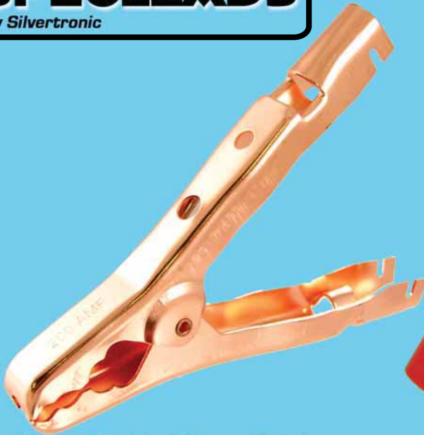
Large Charger Clip, Steel, Copper Plated, 200 Amp