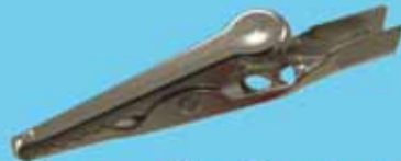
Alligator Clip, Steel with U-Shaped Tail, 10 Amp